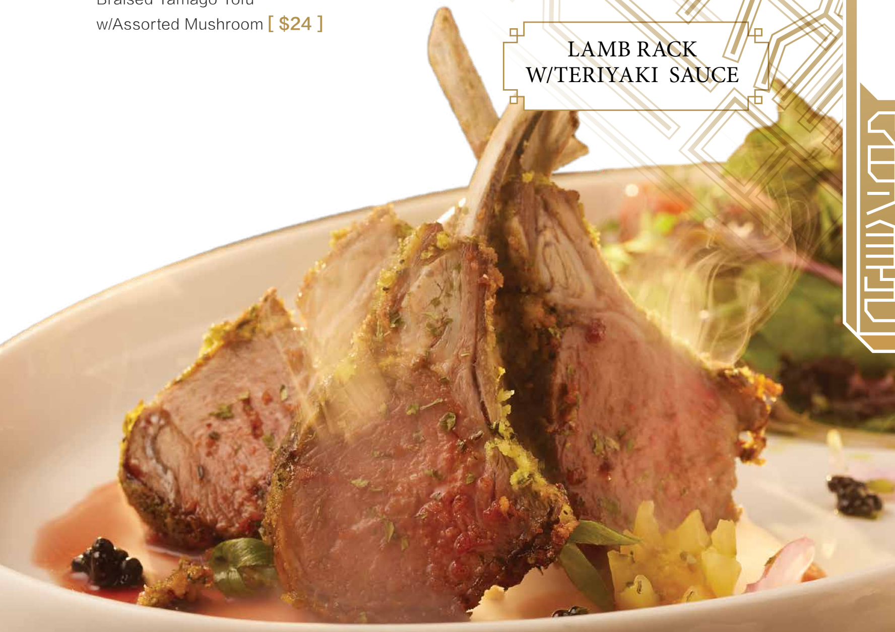
LAMB RACK W/TERIYAKI SAUCE