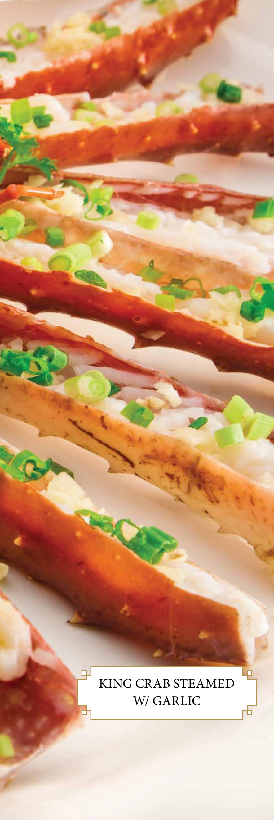
KING CRAB STEAMED W/ GARLIC