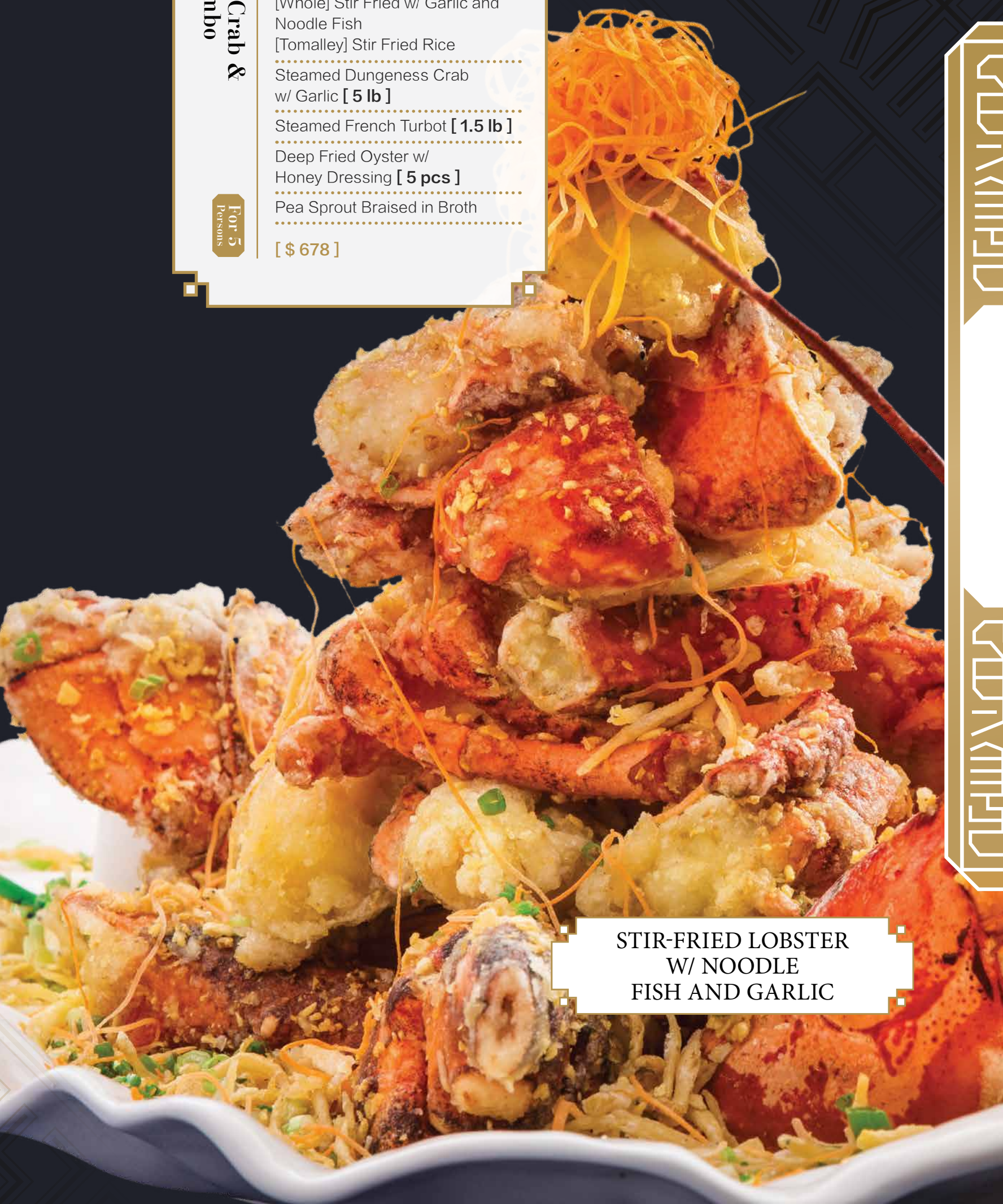
STIR-FRIED LOBSTER W/ NOODLE FISH AND GARLIC