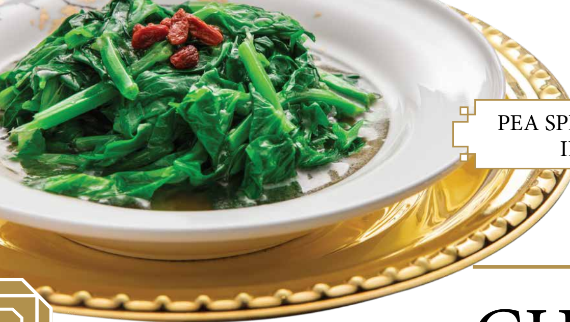
PEA SPROUT BRAISED IN BROTH