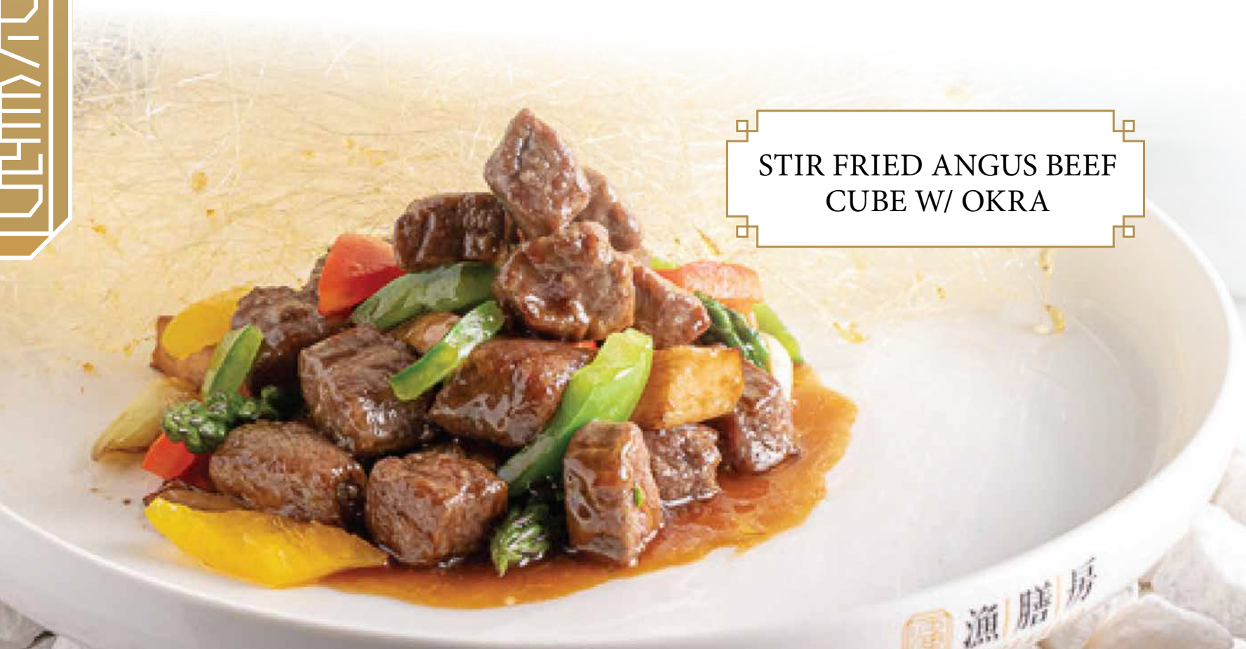
STIR FRIED ANGUS BEEF CUBE W/ OKRA

Stir Fried Noodle w/ Dried Scallop & Shrimp [ $28 ]