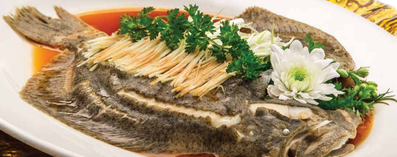
STEAMED TURBOT FISH

Japanese Fish Sashimi Assorted Sashimi Platter [ 15 pcs ] Yu Seafood Soup [ For 7 ] Peking Duck Slice Minced Duck Meat w/ Lettuce King Crab [ 6 lb ] [Body] Stir Fried w/ Maggie Sauce [Claws] Steamed w/ Garlic A Grade Lobster [ 6 lb ] [Whole] Stir Fried w/ Garlic [Tomalley] Rice w/ Soup Steamed French Turbot [ 2 lb ] Pea Sprout Braised in Broth [ $1118 ]