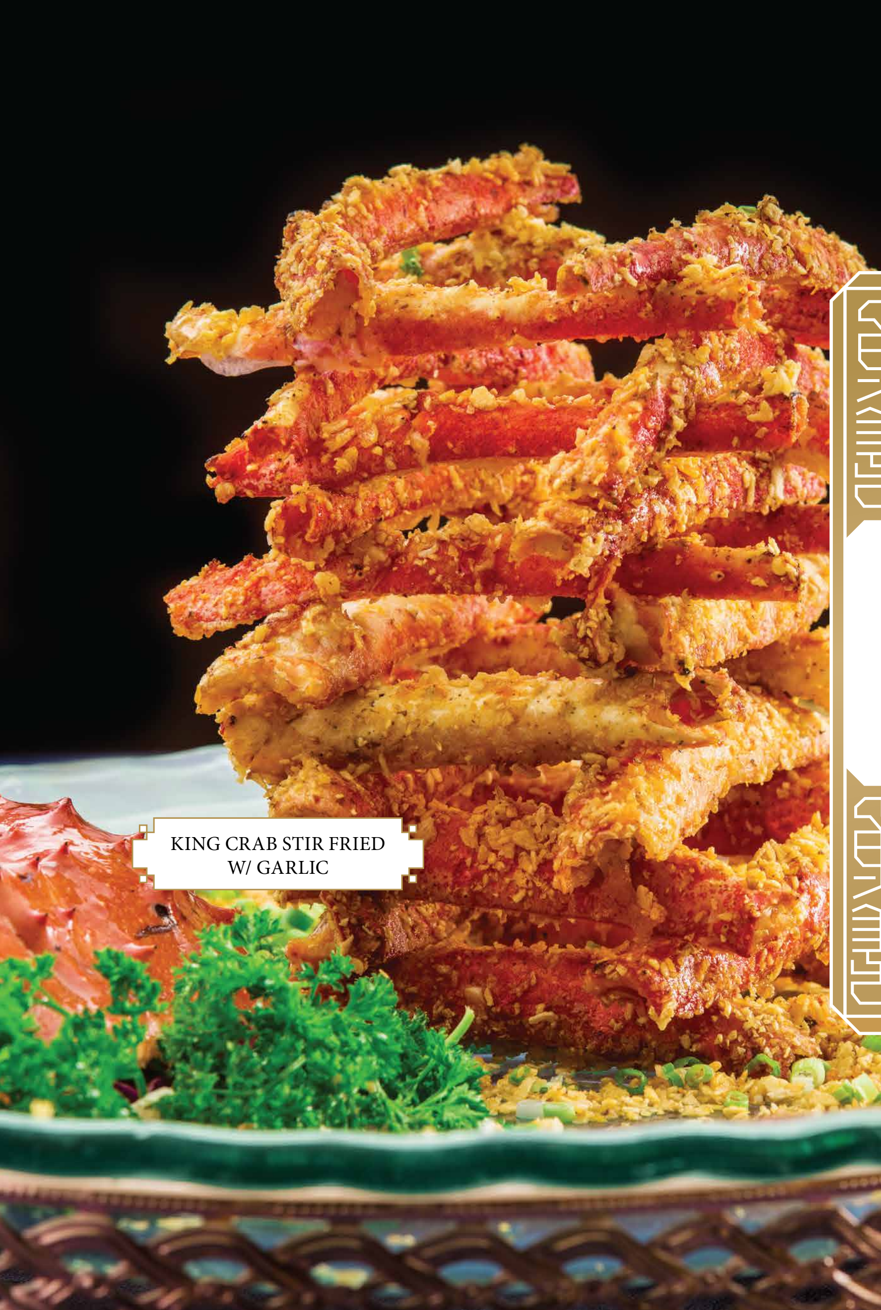
KING CRAB STIR FRIED W/ GARLIC