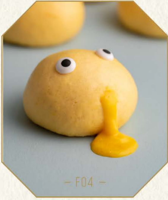
F04 MOLTEN CUSTARD SALTED EGG YOLK BUNS [3 pcs] $8.50